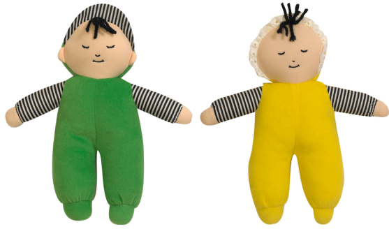
Baby's First Doll CF100-760B GREEN CF100-760G YELLOW L 10" x W 9" x H 2"