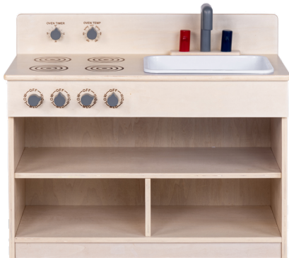
Toddler 2-in-1 Kitchen Center AG1092 L 29.25" x W 13.5" x H 25"