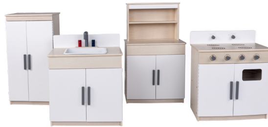
4-Piece Complete Kitchen Set AG4000