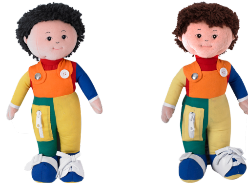
Learn to Dress - Manual Dexterity Dolls CF100-851P CF100-853P CF100-856P CF100-858P L 15" x W 6.5" x H 3.5"