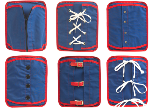
Manual Dexterity Boards Set of 6