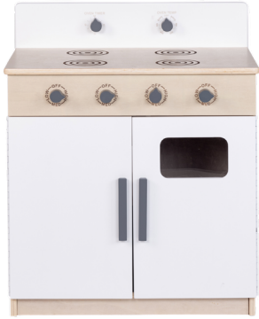
Stove AG1072 L 23.25" x W 13.5" x H 29"