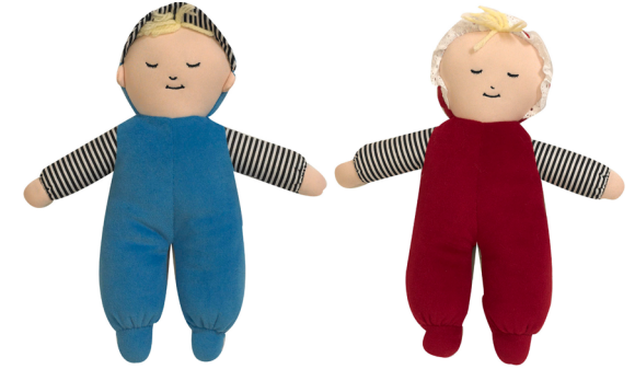
Baby's First Doll CF100-762B BLUE CF100-762G RED L 10" x W 9" x H 2"