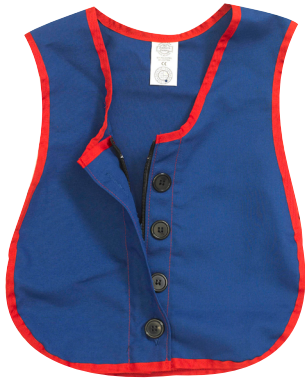
Manual Dexterity Vest Zipper/Button