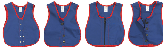
Manual Dexterity Vests Set of 4