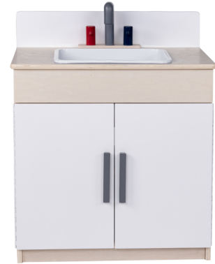
Sink AG1074 L 23.25" x W 13.5" x H 29"