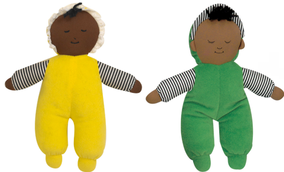
Baby's First Doll CF100-763B GREEN CF100-763G YELLOW L 10" x W 9" x H 2"