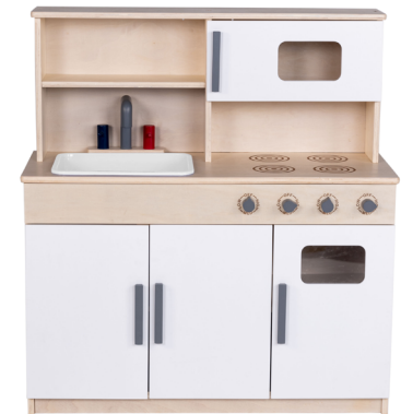
4-in-1 Kitchen Center