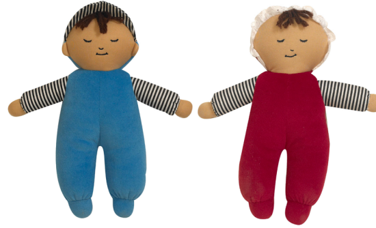
Baby's First Doll CF100-761B BLUE CF100-761G RED L 10" x W 9" x H 2"