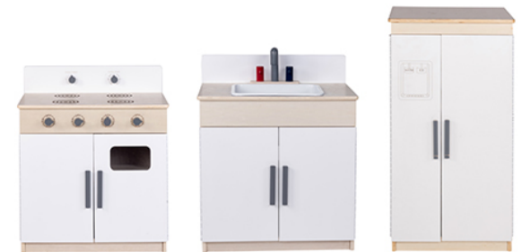
3-Piece Kitchen Set AG4003