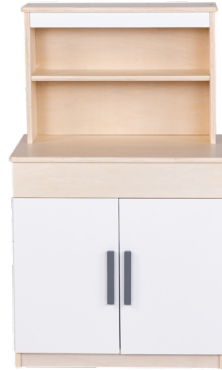
Hutch AG1073 L 23.25" x W 13.5" x H 40"